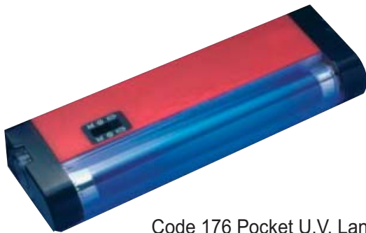
Code 176 Pocket U.V. Lantern

To assist in the detection of tampering or of unauthorised access when covert (U.V. printed/VOID) seals have been used